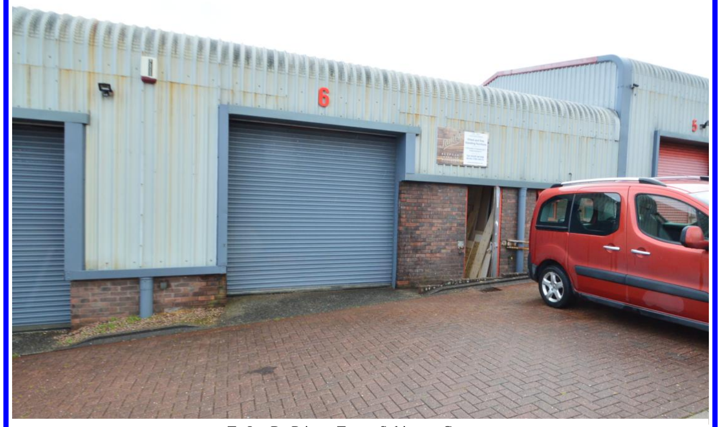
To Let By Private Treaty Subject to Contract

MODERN INDUSTRIAL / WAREHOUSE UNIT - 1,030 SQ.FT (96 SQ.M)